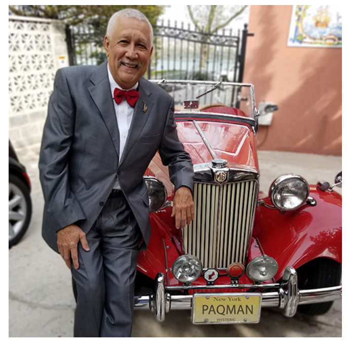
Paquito D'Rivera