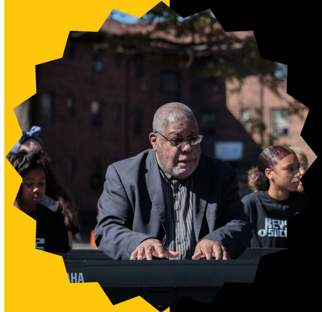
NAF KIDS, 2024-25 Tony Turner Photography