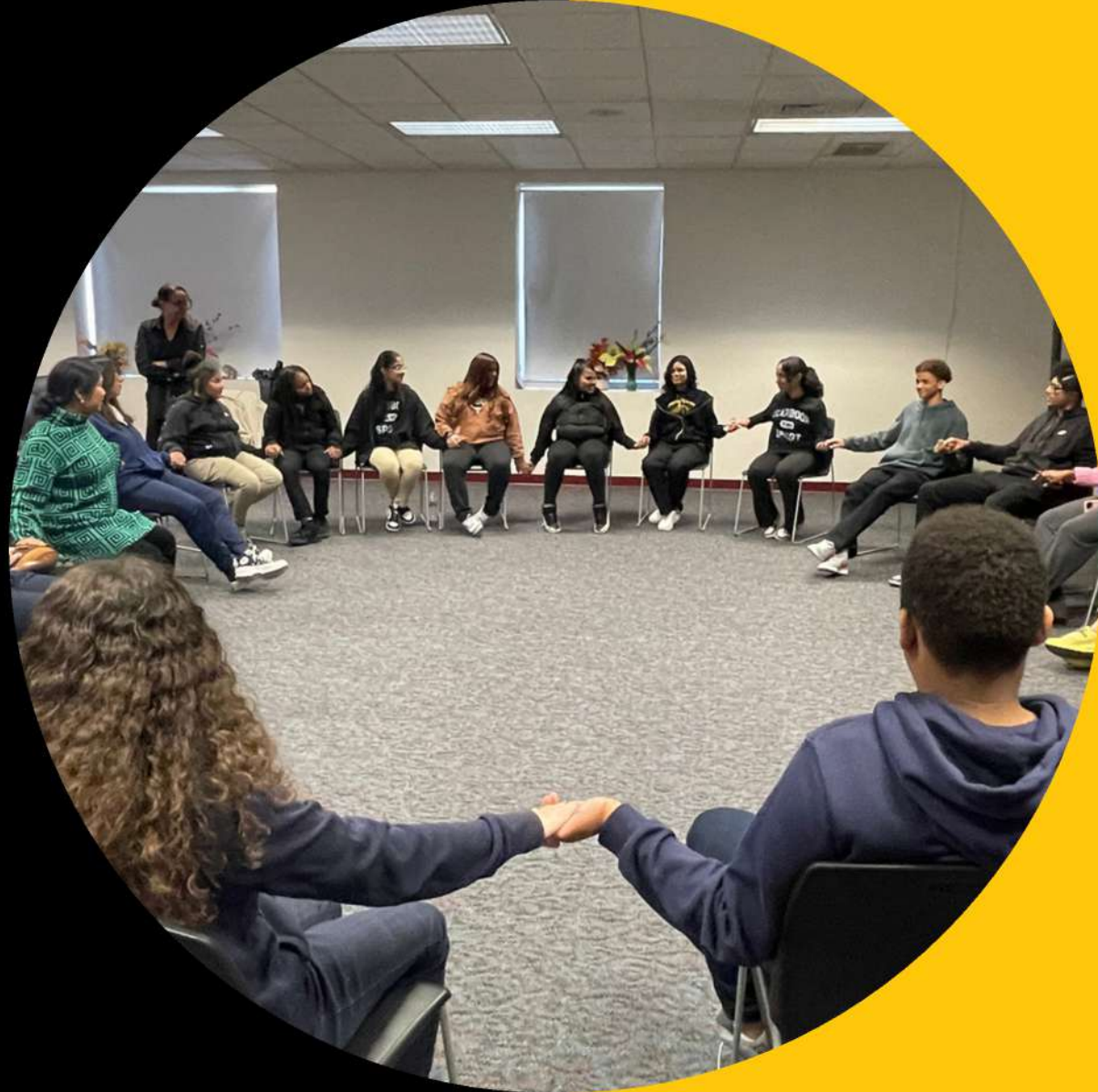
Back To The Future, Drama with a Twist 2023-24