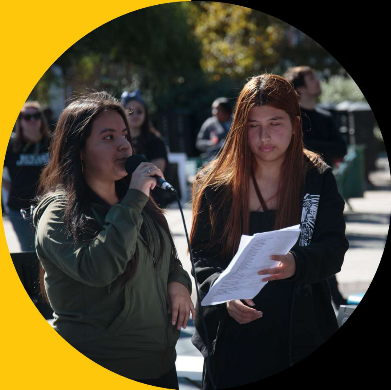
NAF KIDS, 2024-25