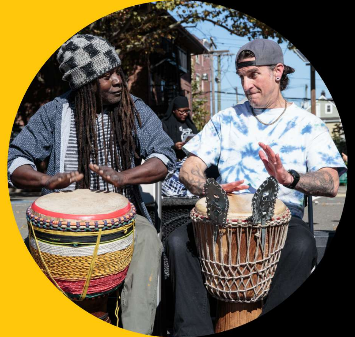
NAF KIDS, 2024-25