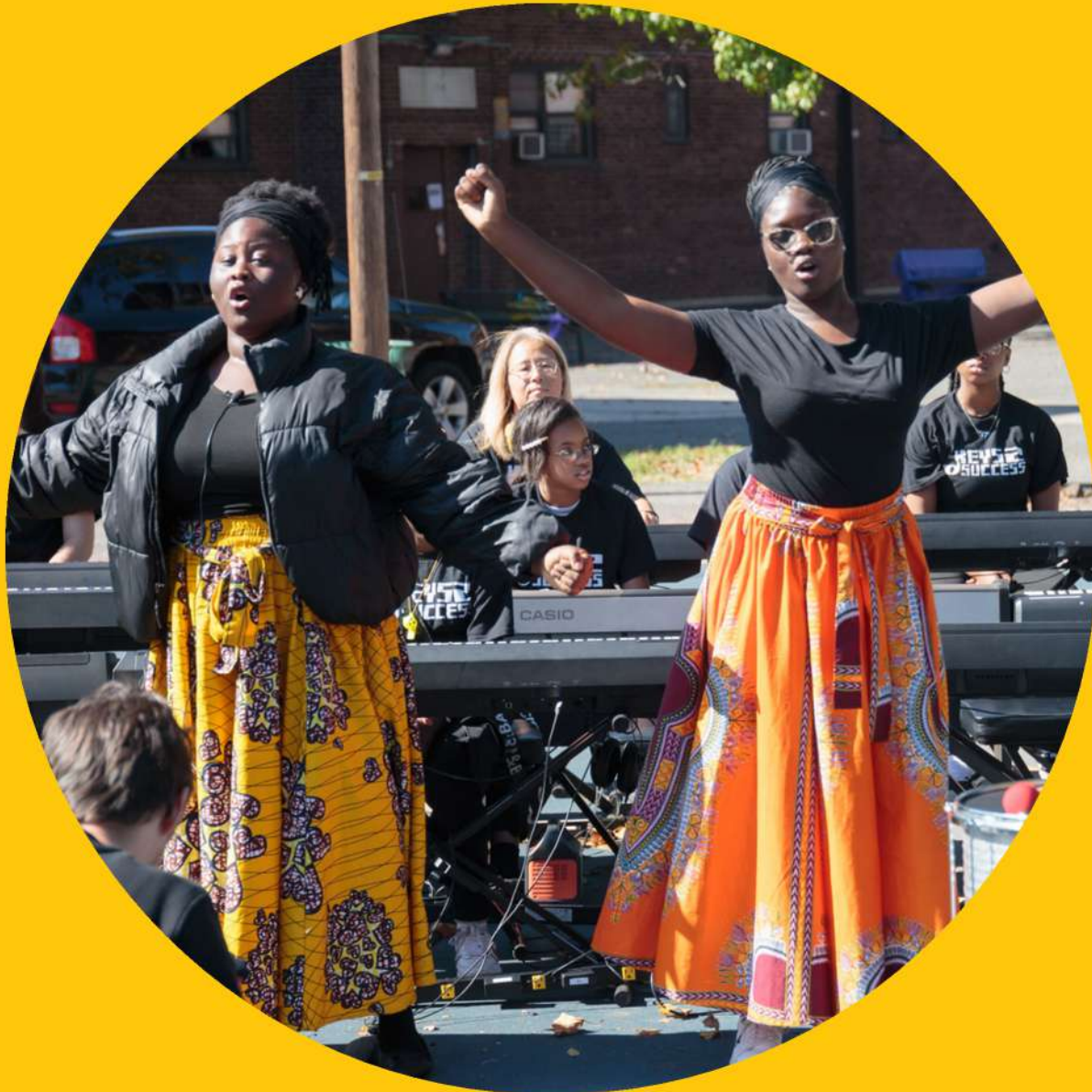
NAF KIDS, 2024-25