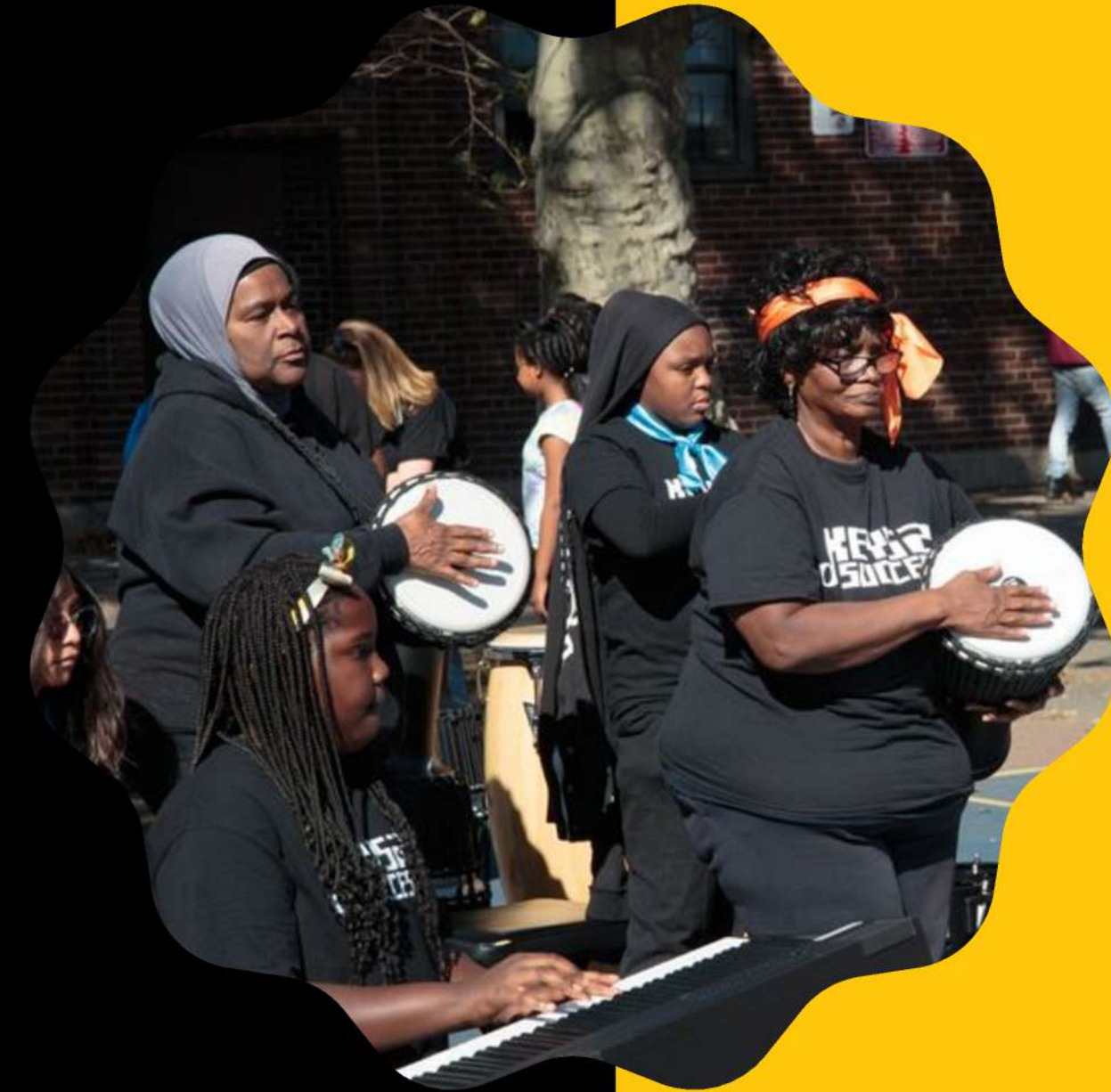
NAF KIDS, 2024-25