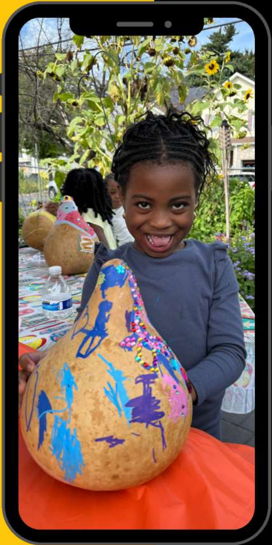
Squash & Shekere 2023-24