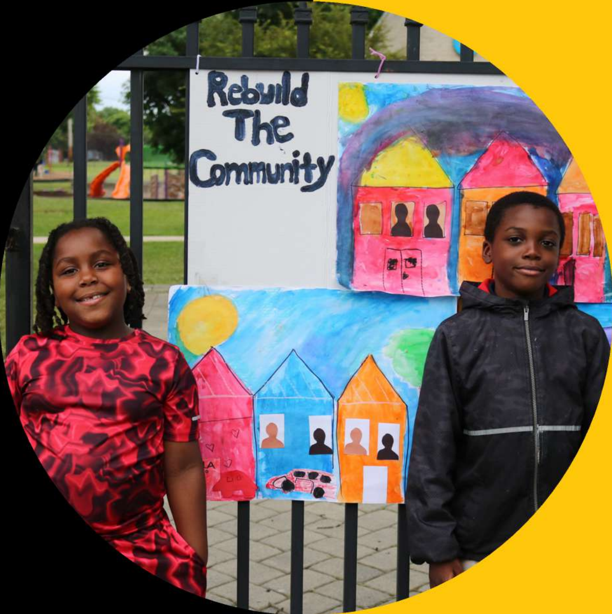
Through the eyes of Newarks Youth. What's a community? 2023-24