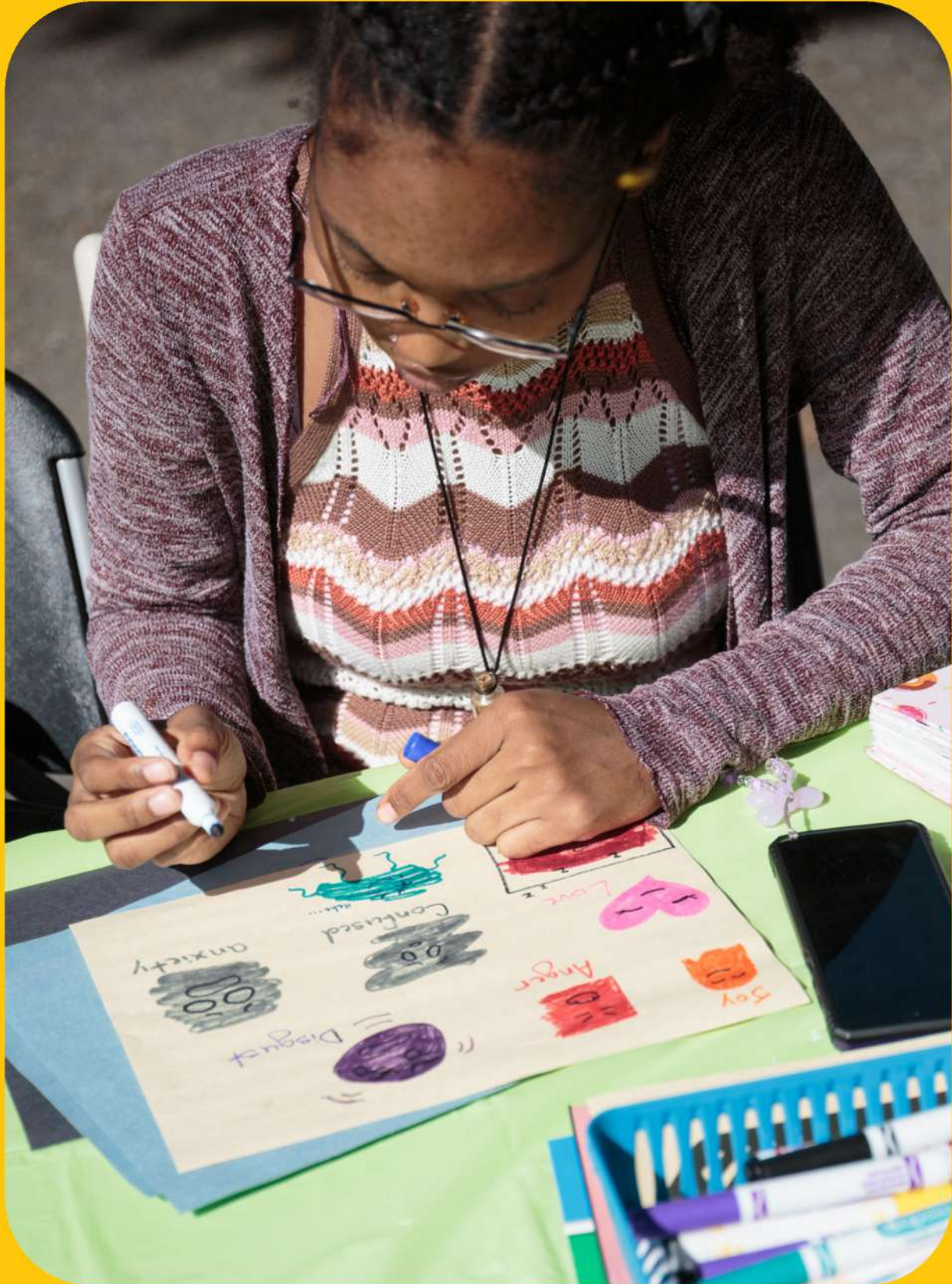
NAF KIDS, 2024-25