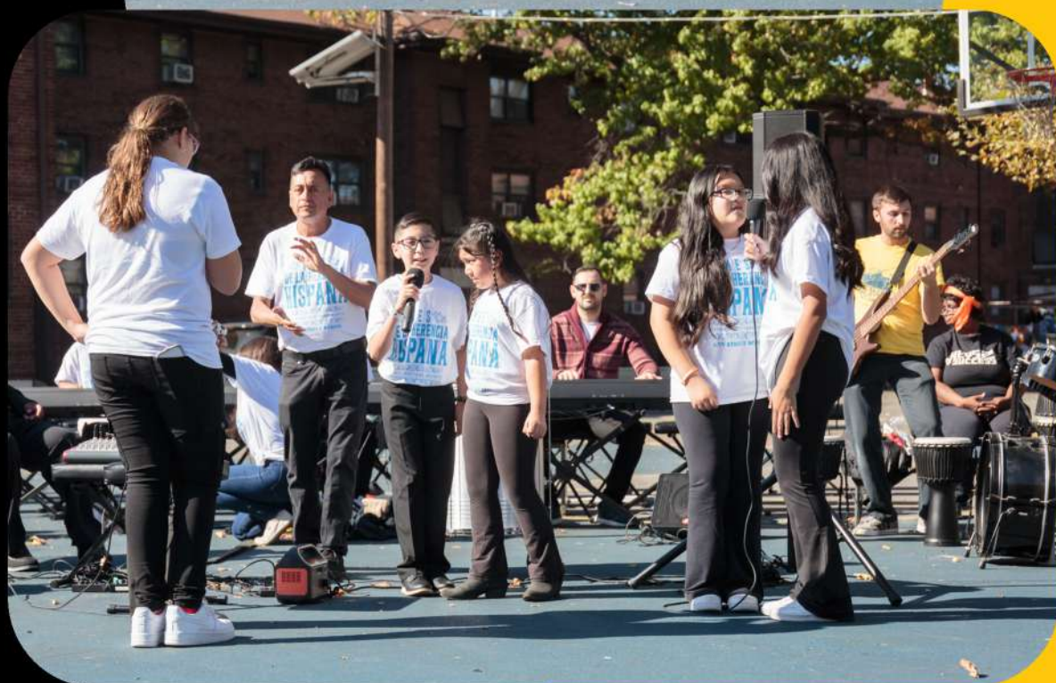
NAF KIDS, 2024-25 ArtsEd Newark