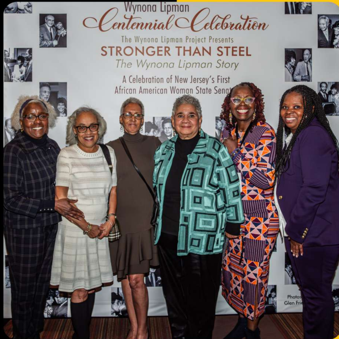
The Wynona Lipman Project, Butterfly Arts Media 2023-2024